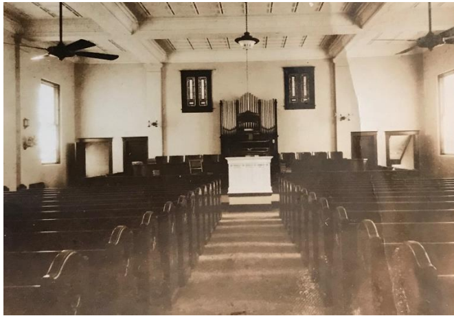
Historic church

Original organ and no stained glass in windows!